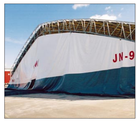
The end walls' fabric is lifted and attached to the frame.