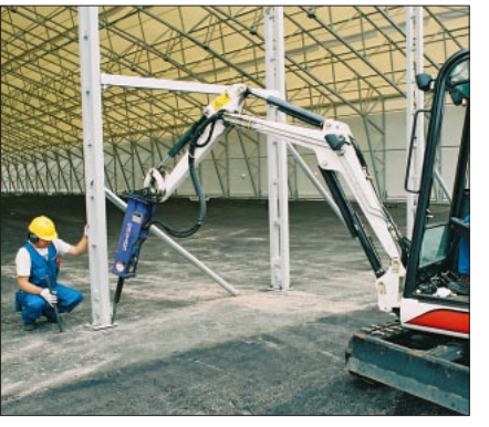
The cover is attached to the frame and the gable columns are anchored in place.

Made entirely from tubular profiles, the steel truss frame is structurally spacious. The standard colour of the frame is light-grey (RAL 7038).