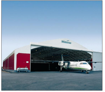
Widerøe's Flyveselskap ASA, aircraft hanger at Sandefjord, Norway, 54 x 40 m (2,160 m<sup>2</sup>).