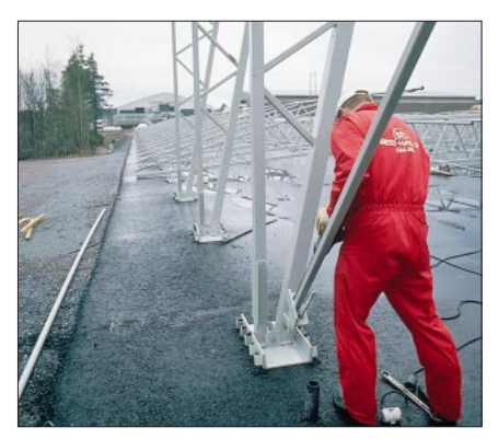
Frame elements are arranged at the hall location and fastened together into frame sections with bolted joints.