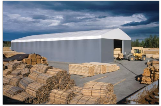
Storage shed 40 x 20 m (800m<sup>2</sup>) where heat insulation and automatic air dehumidifiers ensure optimum moisture conditions. Mustola Dryer Oy, Lappeenranta.