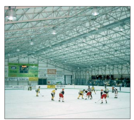
Mänttä Indoor Ice Stadium, 69 x 36 m (2,484m<sup>2</sup>).