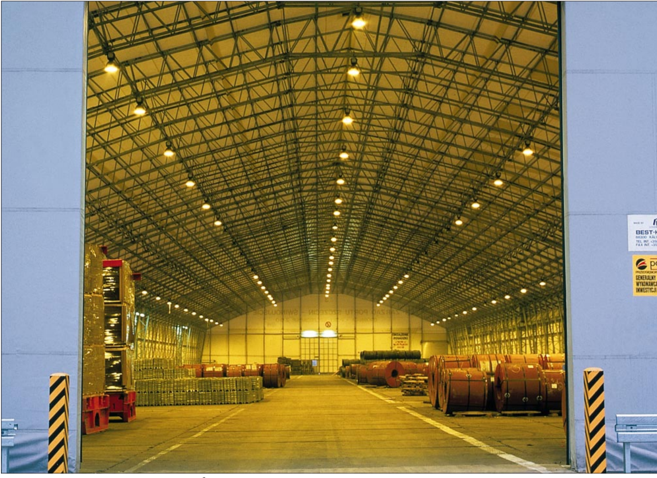
Harbour terminal, 186 x 36 m, 6,696 m<sup>2</sup>. Port of Szczecin, Poland.