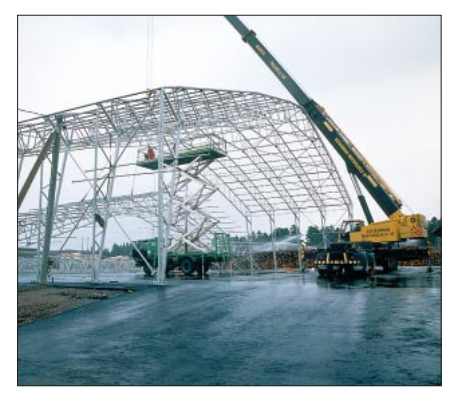
The frame is raised one section at a time and the sections joined together.